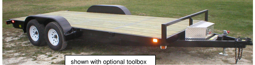
shown with optional toolbox